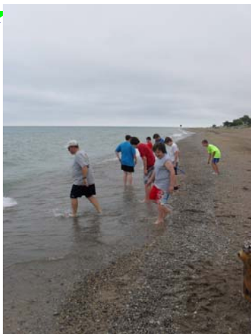
Illinois Beach Campout